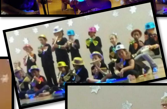
Performing Arts Concert