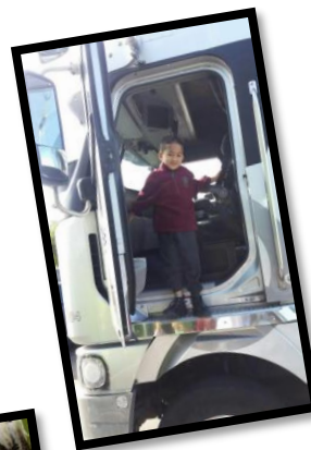
Student of the Month Iemon from Room 1

The next assembly is on Wednesday the 15 th of November . Room 12 will be presenting. See you there!