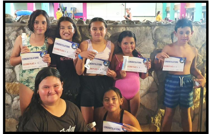
Flippaball Waka Wairau 2nd Place