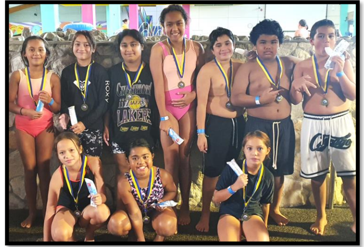
Flippaball Wairau Warriors 1st Place