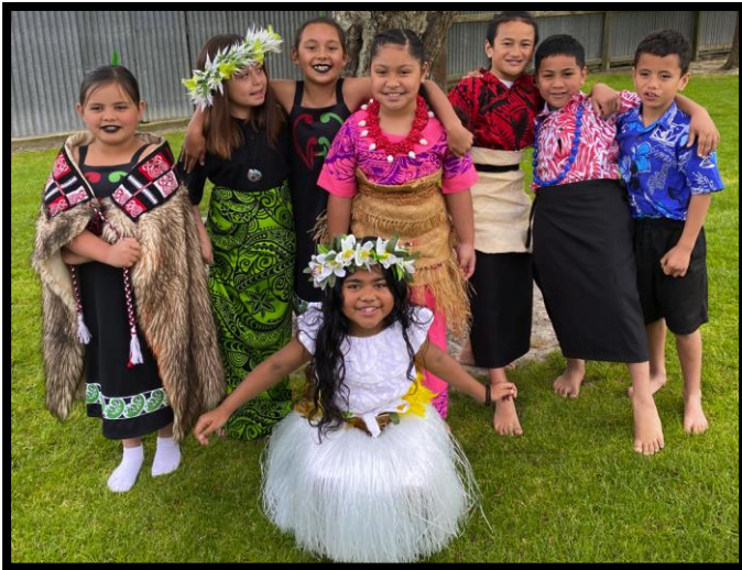
Room 9 Language Festival participants