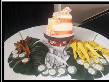
Language Festival 10 Year Celebration