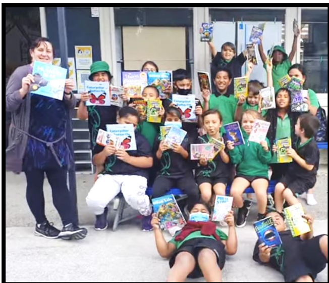
Room 8 was really excited to receive their Duffy Books at the end of last term.