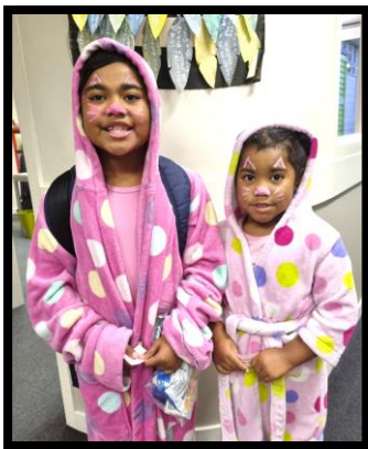
Pink Shirt Day

Book order leaflets have been sent home this week. If you would like to order a books/books for your child online please follow the instructions on the order form, otherwise you can send the correct money in an envelope to the office before the 27 th of May.