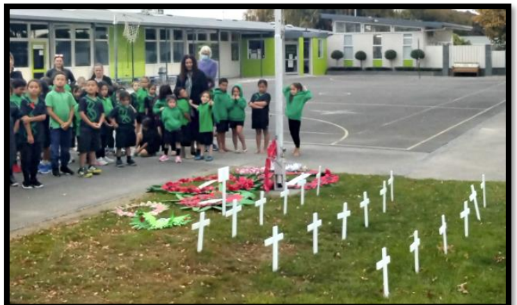
On Monday the 2 nd of May, our school had our own ANZAC ceremony. Each class made a wreath to place under the flagpole.